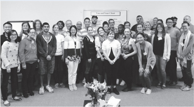
Graduates of the Peer Support training.