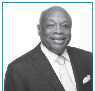
The Honorable Willie L. Brown, Jr. to present the 2014 Nancy Pelosi Lifetime Achievement Award

Compassion is Universal will be instrumental in conveying the needs of our clients to a diverse audience including prominent members of San Francisco's philanthropic