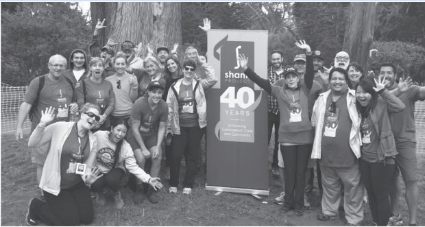
Shanti's amazing team of volunteers and staff at the 2014 AIDS Walk San Francisco. Shanti raised $12,500.

Since 1974, Shanti has trained over 18,000 volunteers in the Bay Area in the Shanti Model of Peer Support, and those trained volunteers have in turn provided millions of hours of practical and emotional support to individuals living with a life-threatening illness.