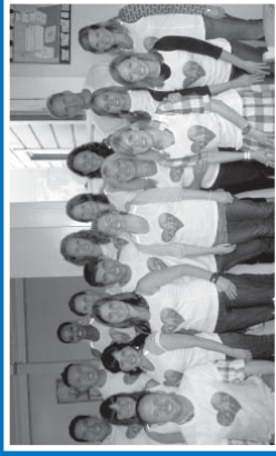
Shanti C.A.R.E.S. (Compassionate Advice, Banning Stigma, Enhance Services) members getting ready to participate in San Francisco Marathon on July 25, 2010. The Shanti C.A.R.E.S. team launched this year as a way for participants to join an adult marathon or half-marathon training, and fundraising group that also supports Shanti's mission of providing practical and emotional support to San Francisco's most vulnerable individuals living with life-threatening illnesses.