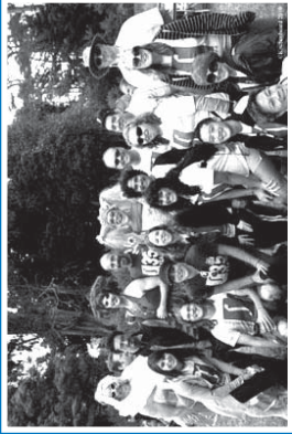
Over 20 Shanti staffers showed up on Sunday July 18, 2010 to walk and volunteer, raising over $12,000 for the San Francisco AIDS Walk.