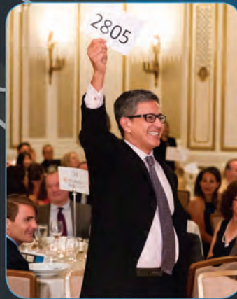
Hopeful bidder during the exciting live auction