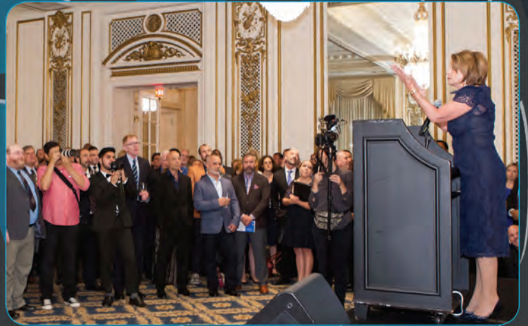
Congresswoman Nancy Pelosi, speaking at the opening reception for Compassion Is Universal